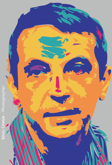
Silviu Gheție – Photographer